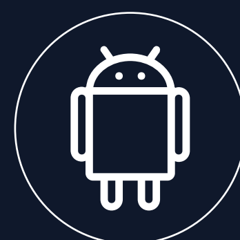
Android 12+Linux Dual-System