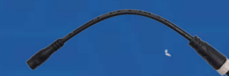
DC Patch Cord