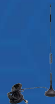
4G External Suction Cup Antenna