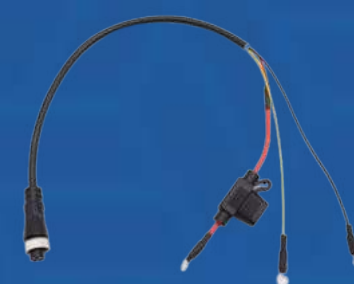
ACC Power Cord