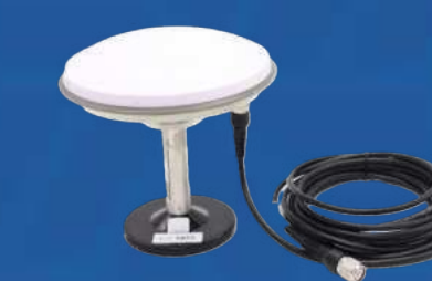
RTK Mushroom Antenna (TNC Connector)

* The technical specifications of this product are subject to change without prior notice