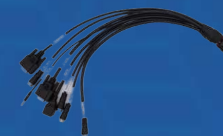
26-PIN Deutsch Interface Functional Bus