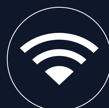
Dual-band WiFi 5