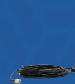
Data Radio External Suction Cup Antenna