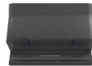
Docking Charger (Optional)