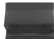
Docking Charger (Optional)