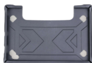
Leather Case (Optional)