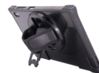
Rotating leather sleeve (Optional)